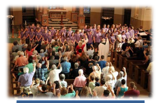
Youth Ministry Mission Trip Blessing

Volunteer Time Commitment - varies. New volunteers are sought each spring and summer.